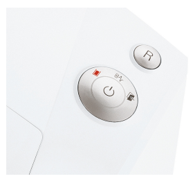
The full bin is indicated via the display and the machine switches off automatically.