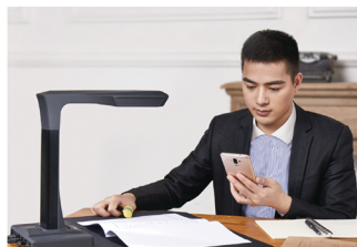
Law / CPA Firm

Scan book, magazine, drawing, picture, blueprint, receipt and so on.