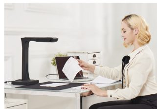
Accounting / Finance