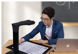
University / School