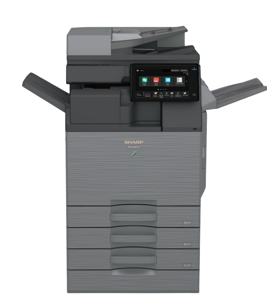
BP-50C45 shown with Inner Folding Unit, Right Side Exit Tray, and 2-drawer Paper Deck.