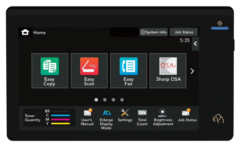
10.1" (diagonally measured) customizable touchscreen display.