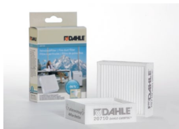
Fine particle filters Dahle 20710