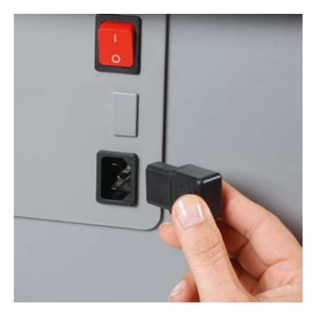
Detachable IEC power plug makes the document shredder quick and easy to move from A to B \,