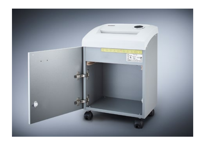
Dahle Waste 203 document shredder