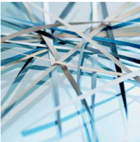
P-2 security: recommended, for example, for data media containing internal data that are to be made illegible