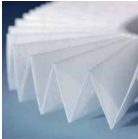
Environmentally friendly filter is made of special 3-ply, fully recyclable non-woven material