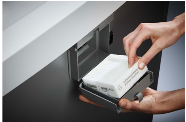
Dahle Top Secret 706air document shredder