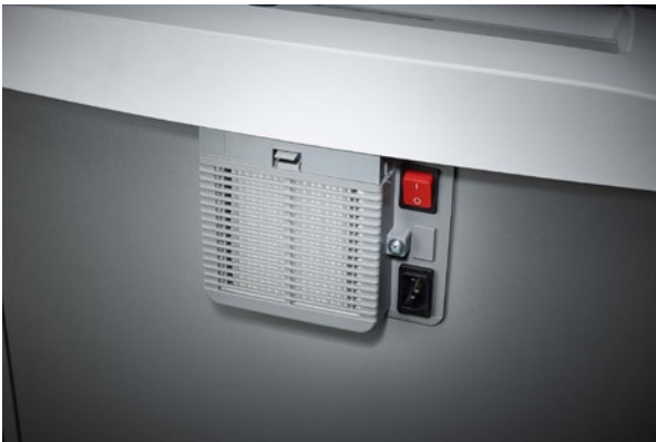
Dahle Top Secret 706air document shredder