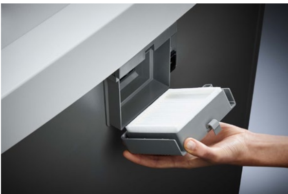
Dahle Top Secret 706air document shredder