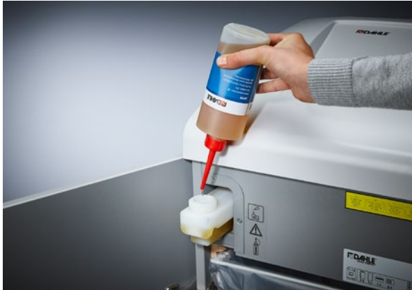
Dahle Top Secret 706air document shredder