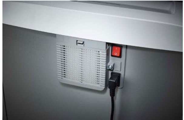
Dahle Top Secret 706air document shredder