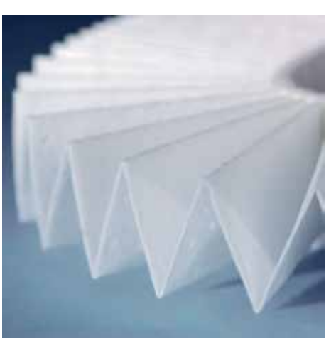
Environmentally friendly filter is made of special 3-ply, fully recyclable non-woven material