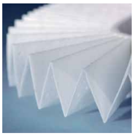
Environmentally friendly filter is made of special 3-ply, fully recyclable non-woven material