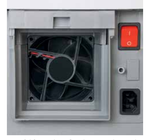
Powerful fan sucks in fine dust particles inside the document shredder and feeds them to the filter