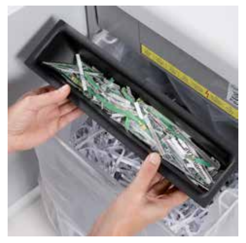
Separate, integrated waste boxes help to sort shredded paper, CDs, DVDs, cheque and credit cards for eco-friendly recycling