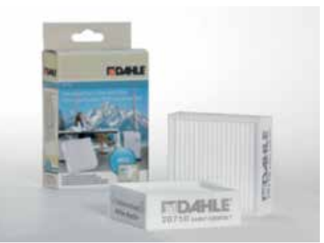
Fine particle filters Dahle 20710